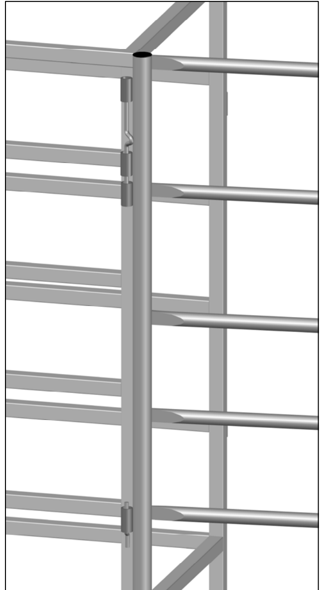
PANEL TO REAR OF STRIPPING CHUTE (PIN TO SPOOL)