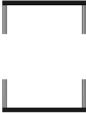
(B) STABILIZER BAR

STANDING BEHIND THE CHUTE PANEL TO LEFT SIDE CHUTE CONNECTION w/ POST A1