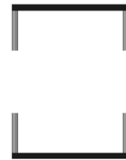
(B) STABILIZER BAR

STANDING BEHIND THE CHUTE PANEL TO RIGHT SIDE CHUTE CONNECTION w/ POST A2